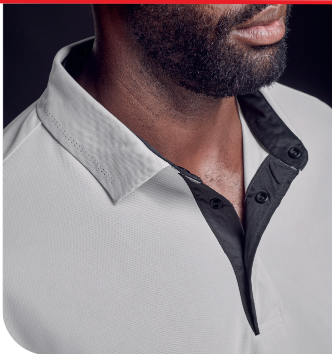
PRESS STUD PLACKET WITH CONTRAST DETAIL