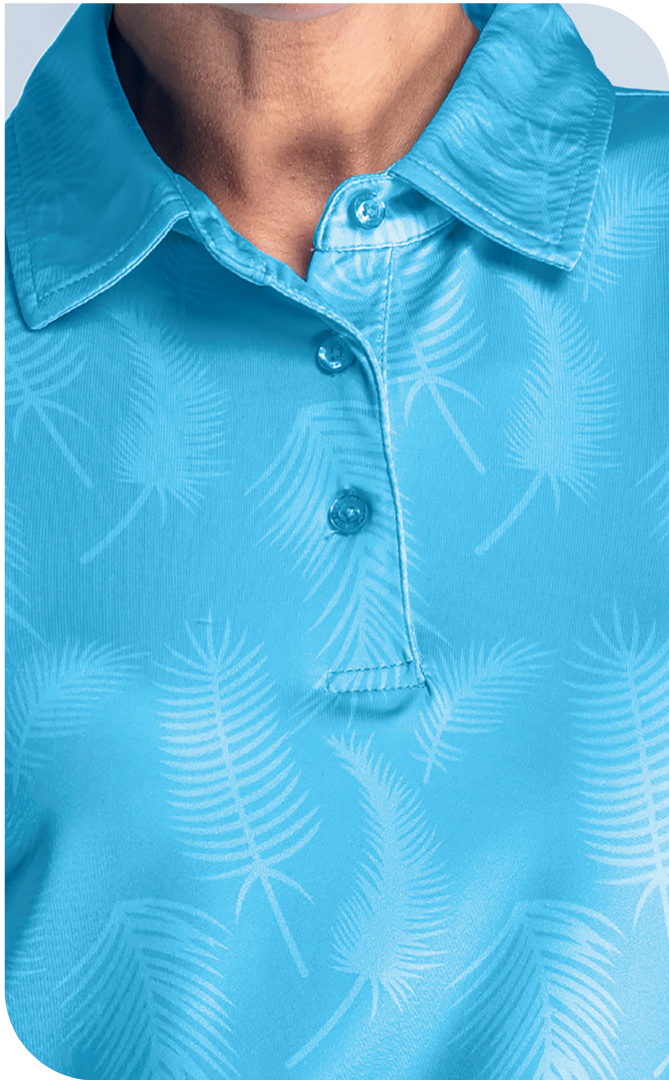
SUBLIMATED FEATHER DESIGN

An EXCLUSIVE golf shirt featuring a one-of-a-kind sublimated FEATHER DESIGN