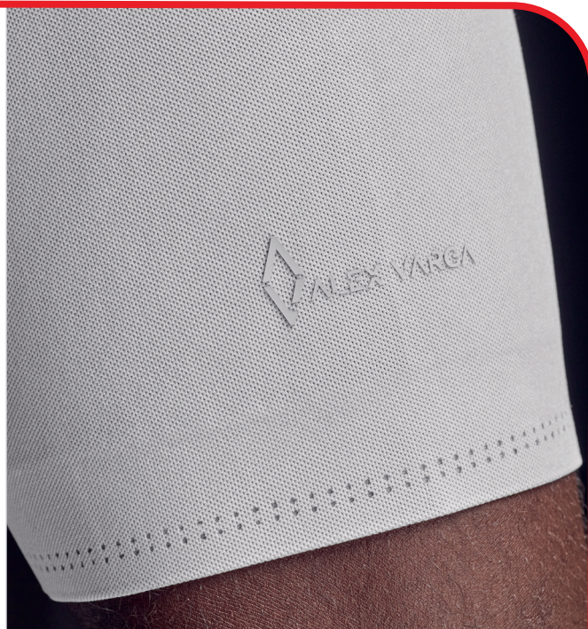
UNIQUE LASER CUT DESIGN WITH SEAMLESS FINISH AND ALEX VARGA SILICONE LOGO ON SLEEVE