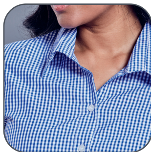
OPEN COLLAR AND CLASSIC MINI CHECK DETAIL