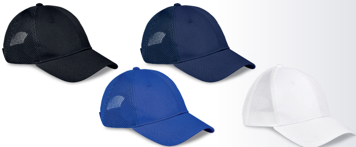
BRANDED USING DIGITAL TRANSFER