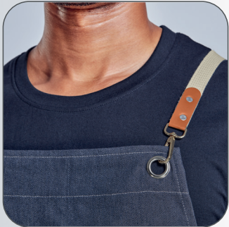
METAL EYELETS WITH HARDWARE BUCKLES