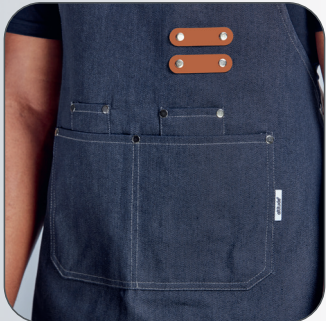
MULTI PATCH POCKETS WITH DOUBLE FAUX LEATHER HOLDER