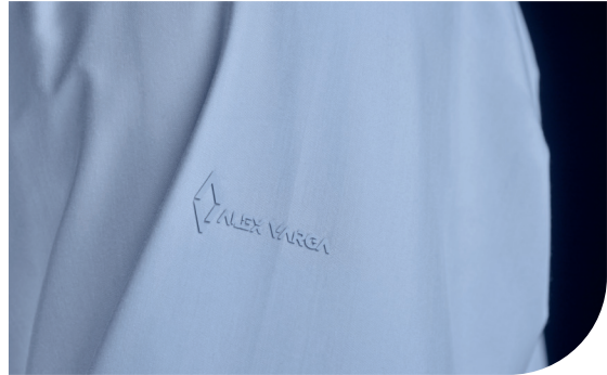
ALEX VARGA SILICONE LOGO ON SLEEVE

CW-AV-188-A & CW-AV-189-A ARE AVAILABLE IN THE 4 COLOURS SHOWN ON THIS PAGE