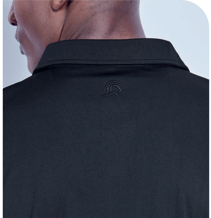
BLACK KNIGHT LOGO EMBROIDERED ON BACK NECK YOKE OF MENS & LADIES GOLF SHIRTS