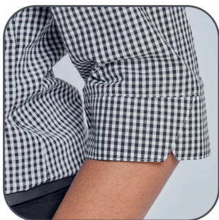
3/4 CUFFED SLEEVE WITH SLITS