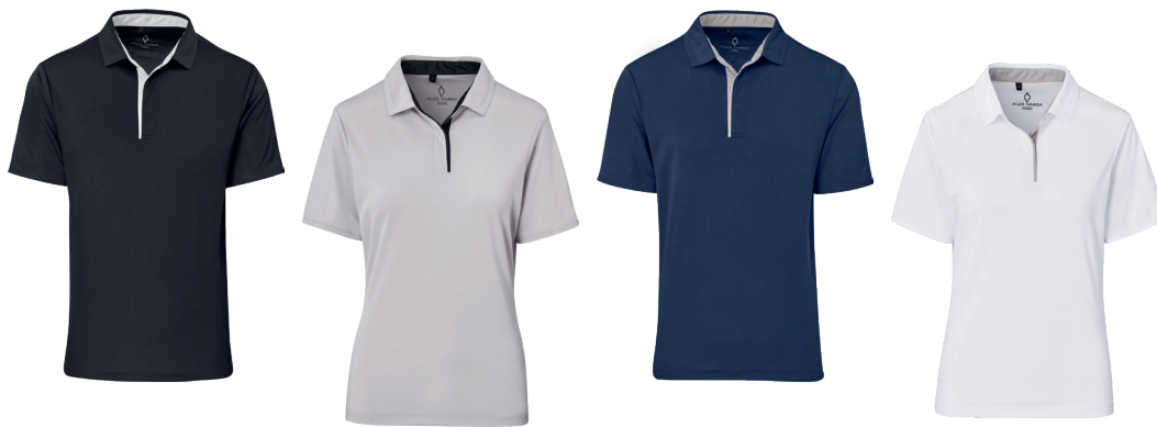
GS-AV-287-A & GS-AV-288-A ARE AVAILABLE IN THE 4 COLOURS SHOWN ON THIS PAGE