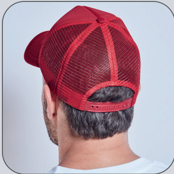
PLASTIC SNAP CLOSURE