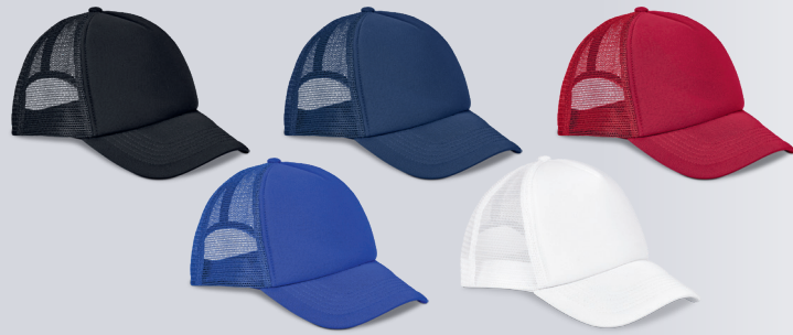
BRANDED USING DIGITAL TRANSFER